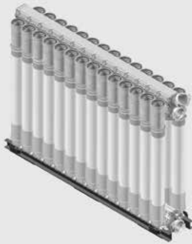
MEMCOR® CP II SYSTEM ASSEMBLY RACK