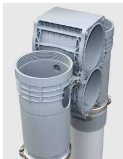
THE L40 MODULE HOUSING, WASTE HEADER AND FILTRATE HEADER

Self-supporting MemRACK arrays reduce membrane array footprint by up to 50% compared to previous MEMCOR system offerings. MemRACK arrays also fit in standard shipping containers allowing MEMCOR CP II systems to be quickly delivered and deployed anywhere in the world.