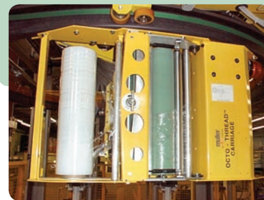
Octo-Thread film carriage

With its rear opening film loading gate, the Octo-Thread film carriage allows for fast, easy and safe film threading. The standard tilting film mandrel allows the operator to load a film roll with greater ease. It also reduces the risk of damaging the film roll during loading.